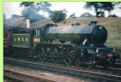
KIMBOLTON CASTLE Brookmans Park 1937

The B17 'Sandringham' class were designed by Sir Nigel Gresley and built over a 9 year period from 1928. A first batch of 10 locomotives were delivered to the LNER from The North British Locomotive Company in Glasgow. LNER – Darlington Works continued construction (52) including design changes and improvements from 1930. The final batch (11) were also produced in Darlington at the local works of Robert Stephenson's.