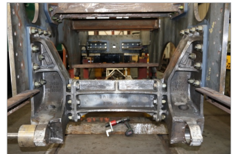
Mainframe structure completed

GET ON BOARD.... Join us for the next phase